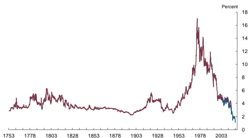
Chart 1. UK long-term nominal interest rates (a)