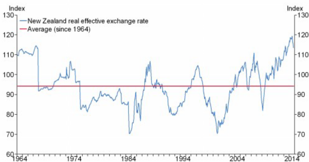
Figure 2 New Zealand's real effective exchange rate

While we recognise the pressures associated with exchange rate overshooting, there is little the Bank can do to sustainably alleviate an overvalued real exchange rate, whether through monetary policy actions or the choice of exchange rate regime. New Zealand has tried various exchange rate regimes over the past 40 years, including a fixed rate, crawling peg, and now a floating rate. We have found, however, that the choice of regime has had little impact on the medium-term level of the real effective exchange rate. Past policy attempts to give the exchange rate more weight in monetary policy decisions tended to generate more interest rate volatility, with little lasting effect on the real exchange rate.