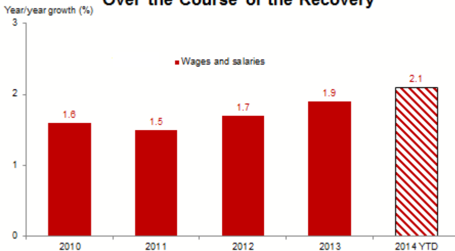
Chart 1. Wage Growth Has Picked Up Noticeably Over the Course of the Recovery