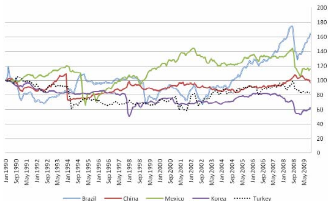
Chart 2: JP Morgan Real Effective Exchange Rate Index Jan 1990 = 100

This flip side of these imbalances was a large current account deficit in the United States, which was reinforced by expansionary U.S. monetary and fiscal policies in the wake of the 2001 recession. In combination with high savings rates in East Asia, these policies generated large global imbalances and massive capital flows, creating the "conundrum" of very low long-term interest rates, which, in turn, fed the search for yield and excessive leverage. While concerns over global imbalances were frequently expressed in the run-up to the crisis, the international monetary system once again failed to promote the actions needed to address the problem. Vulnerabilities simply grew until the breaking point.