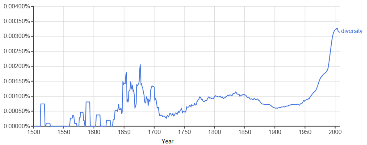
Chart 1: Incidence of the word diversity in books printed since the 16th Century