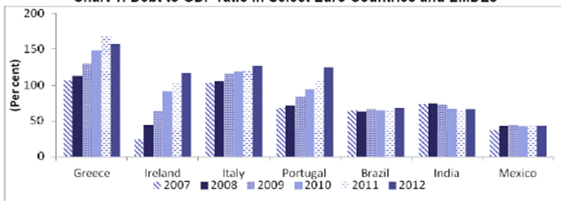
Chart 1: Debt to GDP ratio in Select Euro Countries and EMDEs

6. The contagion emanating from the European sovereign debt crisis coupled with elevated market borrowing requirement amplified the challenges for debt managers in EMDEs, particularly for those who rely significantly on international capital markets for their government market borrowing. The challenge for debt managers in many EMDEs was on two counts: first, heightened volatility and uncertainty in the domestic financial markets due to capital flow reversals triggered by deleveraging of foreign investors; and second, increased exchange rate volatility mostly leading to sharp depreciation of the currency. The countries, which had scope to issue short-term debt due to elongated maturity structure and, at the same time, depended largely on domestic debt, could weather these challenges by issuing larger quantum of short-term debt domestically. On the other hand, the countries having short maturity debt structure were exposed to greater rollover risk. In the above backdrop, one could reasonably argue that optimal debt structure could help debt managers to meet challenges posed by the contagion from the global financial turmoil with less pain. Therefore, the debt managers need to pursue the optimal debt structure instead of a sub-optimal debt structure guided by the narrow and short-sighted objectives. I am sure that deliberations in the conference would focus in-depth on what should be the optimal debt structure compatible with local conditions.