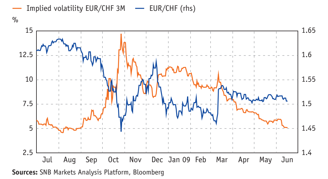
Chart 2. EUR/CHF and exchange rate volatility