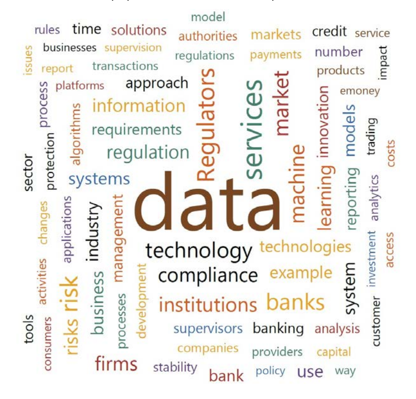
Figure 1: "Wordcloud" of popular words related to suptech